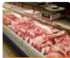
a small butcher shop