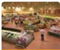
a big supermarket