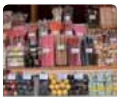
a little candy store