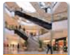
a big mall