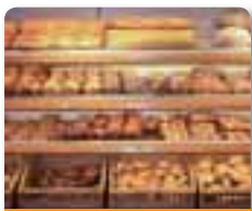
a big bakery