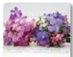
a small flower shop