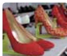
a small shoe store