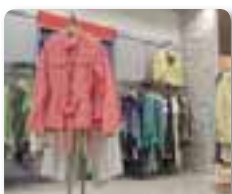
a big clothing store